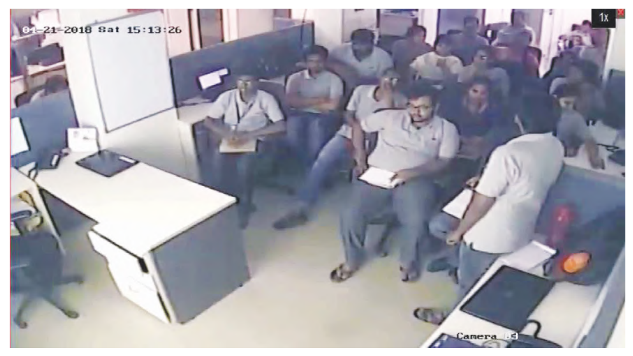
Place of supply of Goods Under GST Act - Bharadwaja 11 |\, P \mbox{ a g e }